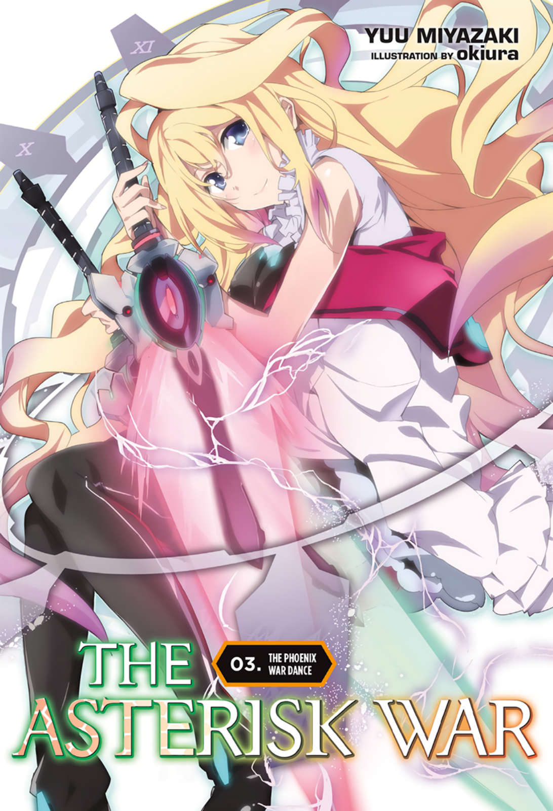
ILLUSTRATION BY okiura